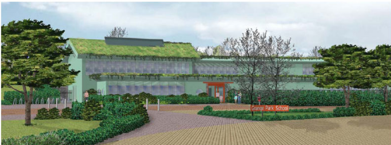
Ref: Artists impression of the view from the South of the proposed building as supplied by the applicant.

The proposal is to build a new school building for Grange Park School and the special needs of its pupils, all of which have Autistic Spectrum Disorder (ASD). The particular ASD needs of the Grange Park School pupils results in any noise impact being more acutely felt than would ordinarily be the case. A school is classed as a noise sensitive receptor in planning terms and with the special needs of these pupils this results in a particularly acute example. The sites close proximity to the M26 and the A227 results in high ambient noise levels across the site.